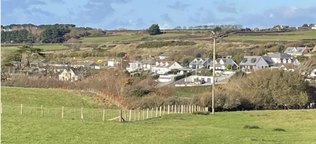
View of Site - Looking North from Georgeham Road